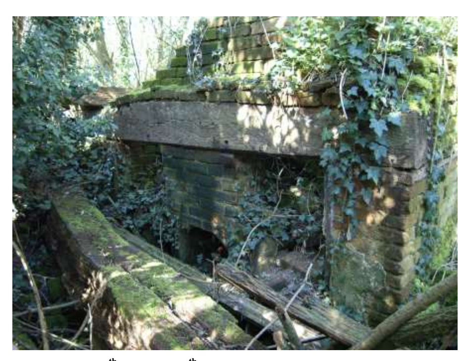
Illus. 1 The intact 16<sup>th</sup> or early-17<sup>th</sup> century fireplace, extending to 9½ feet in width

The house adjacent to Orchard Barn is among the most remarkable buildings in Suffolk. A fine timber-framed structure of the late-16<sup>th</sup> century, extending to over 50 feet in length and complete with original diamond-mullion windows, 'inglenook fireplace' and symmetrical wall bracing, lies empty and partly collapsed in a bramble patch. Despite its predicament, most of the principal components of the frame, including wall studs, tie-beams, arch-braces, storey posts and massive principal joists, remain in sound condition and the building could readily be restored by a specialist in historic carpentry. Notwithstanding its impressive historic credentials and proximity to a road the house is not listed and does not appear on the Register of Historic Buildings at Risk, presumably because it was hidden from successive English Heritage Inspectors by external render and undergrowth. If the structure was properly restored, incorporating the surviving timbers, it would retain sufficient original fabric and historic integrity to remain worthy of listing.