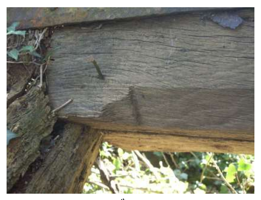
Illus. 6 Detail of distinctive late-16<sup>th</sup> century chamfer stop to binding joists

The surviving 16<sup>th</sup> century timber frame is of excellent quality and obvious historic value. Its loss would be highly regrettable from all perspectives. Despite first appearances the key timbers remain in sound condition and could readily be repaired or incorporated into a new timber frame constructed on the same principals as the original. If the building remains exposed to the elements and ground moisture for very much longer these timbers will quickly decay beyond the point of no return, but at present they remain eminently salvageable. While some components such as the common ceiling joists will require complete replacement, a reconstruction that incorporates all the remaining sound components would retain more historic fabric than most Tudor houses and remain worthy of listing at grade II. It is to be strongly hoped that this remarkable structure, which has survived for so long despite gross neglect, can be saved for the future in such as manner.