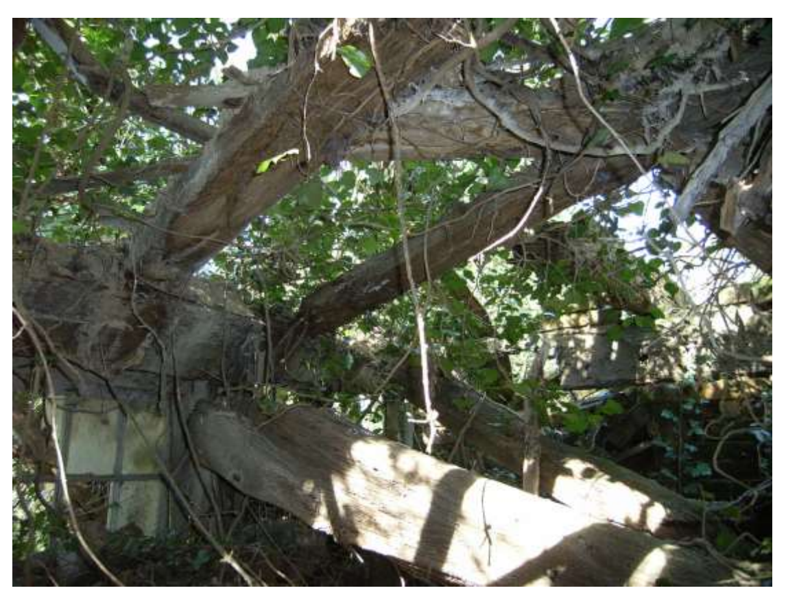
Illus. 5 The interior of the hall, showing the western elevation with first-floor studs and wall brace overhead (the principal fireplace visible to the right). Note the horse shoe suspended from the mid-rail above the 19<sup>th</sup> century glazed window.

farmhouse that faced the pond to the north. This wing was subsequently converted into a house in its own right, and was separated into cottages in the 19<sup>th</sup> century (as it apparently remained in 1904, as indicated by the dividing line on the Site Plan). Such an orientation is also suggested by Nine Elms Farm, which dates from circa 1620 but also follows an east-west alignment. The proximity of the two buildings is striking, and Nine Elms may represent a replacement on the same tenement of a medieval farmhouse with its 'new' rear wing of the late-16th century. The eastward projection of the northern cottage in 1904 may also relate to the truncated main range of the house, although it could equally be interpreted as a lean-to extension.