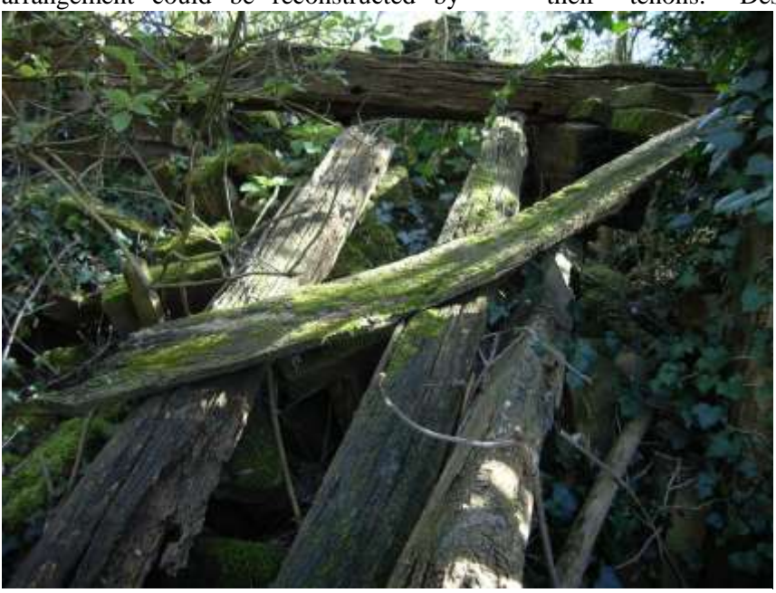
Illus. 3 An external wall brace in the western elevation, still trenched across the studs despite its precarious angle.

in a high-status Tudor merchant's house in the streets of Lavenham. There is evidence