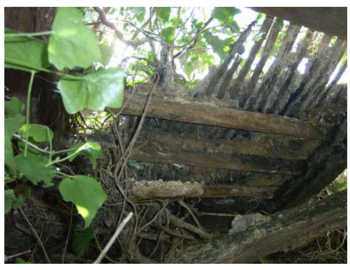
Illus. 2 The original window of 'diamond' mullions in the western elevation, with three intact mullions now lying horizontally (rebated sill to right).

Showing the house (centre) apparently divided into two cottages with Orchard Barn to the south and Nine Elms Farm beyond the pond to the north.